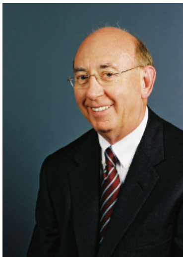
John E. Niederhuber