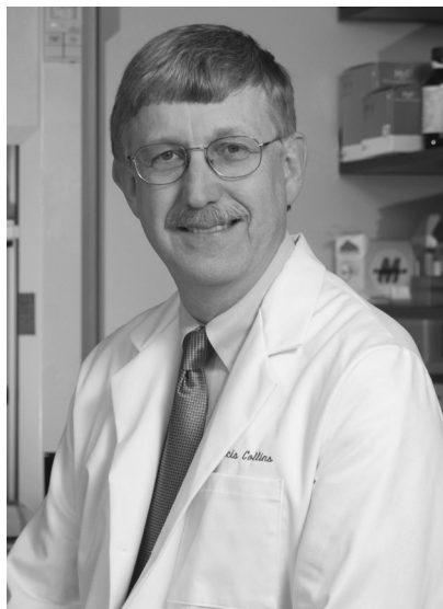
Francis S. Collins

Francis S. Collins, MD, PhD, was unanimously confirmed by the United States Senate as the next director of the National Institutes of Health (NIH) in July of this year. A geneticist and physician, Dr. Collins lead the Human Genome Project which culminated in 2003, yielding a completed sequence of the human genome. He has since initiated and overseen a variety of follow-up projects in large-scale genomics. He served as the director of the National Human Genome Research Institute (NHGRI) of the NIH from 1993 to 2008. As NIH Director, Dr. Collins will oversee the 27 institutes and centers that comprise the NIH as well as the allocation of over $30 billion in federal research funding.