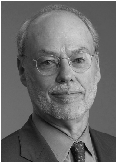
Nobel Laureate Phillip A. Sharp