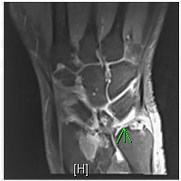
Figure 2 A 60-year-old woman with severe RA. Follow-up MRI showed perforation at the left disc proper of the triangular fibrocartilage complex.

RA with high disease activity and having undergone wrist MRI and ultrasound examinations.