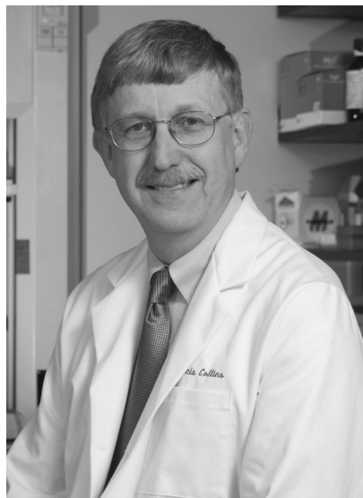
Francis S. Collins

Francis S. Collins, MD, PhD, was unanimously confirmed by the United States Senate as the next director of the National Institutes of Health (NIH) in July of this year. A geneticist and physician, Dr. Collins lead the Human Genome Project which culminated in 2003, yielding a completed sequence of the human genome. He has since initiated and overseen a variety of follow-up projects in large-scale genomics. He served as the director of the National Human Genome Research Institute (NHGRI) of the NIH from 1993 to 2008. As NIH Director, Dr. Collins will oversee the 27 institutes and centers that comprise the NIH as well as the allocation of over $30 billion in federal research funding.