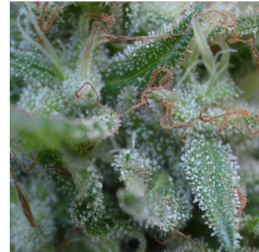
Figure 2 Healthy trichome growth on marijuana plant.