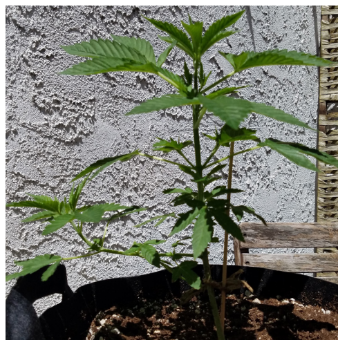
Figure 1 Abnormal lateral lower branch growth on marijuana plant.

Crop disease in marijuana has gone unchecked for many years and the prevalence of these bad crops is rapidly becoming the norm. 3 As early as 2004, I observed symptoms of hop latent viroid in California's marijuana market, coincidentally around the same time as the first reports of cannabis hyperemesis syndrome were documented. Observable symptoms of this plant pathogen include, but are not limited to, brittle lateral branch growth (figure 1), sudden wilting, non-sticky small buds, and a lack of aroma. Evidence of its infection in marijuana crops across the USA and Canada are being reported at an exceeding rate. 4 The most concentrated form of the psychoactive active component, tetrahydrocannabinol (THC), is within the white sticky resin that the marijuana plant produces, known as trichomes (figure 2). 5 This resin also acts as a barrier to protect it from disease, insects, and other debris. 6 In the worst case scenario, hop latent viroid prevents this sticky resin from fully developing on the plant, resulting in small buds appearing like plain leafy material. In the best case scenario, all is well until about the last 4 weeks of bud flowering when healthy normal trichomes rapidly start to become wilted in appearance or rapidly degrade before its normal harvest time, thus originally called 'dudding disease' before any pathogen was scientifically identified as its cause. 7 One could theorize that any nutrients, pesticides, or fungicides sprayed on the foliage by the grower