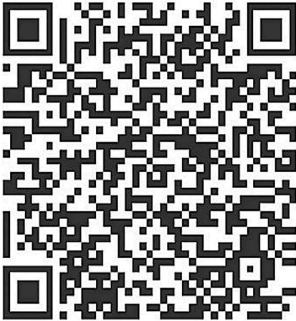
Figure 2 Application for the new mode of mobile internet-based home nursing service.

subcutaneous injection (n=32, 6.15%), general stoma care (n=10, 1.92%), psychological care (n=7, 1.35%), and intramuscular injection (n=2, 0.38%). The constituent ratios of the six major reasons to use the new mode of mobile internet-based home nursing service were 61.35%, 28.85%, 6.15%, 1.92%, 1.35%, and 0.38%, respectively (see table 2).