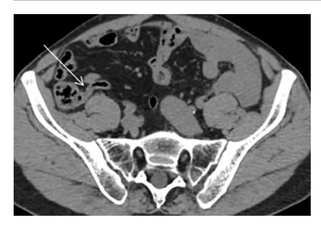
Figure 1 A man in his 60s with acute simple appendicitis. Axial located appendix (arrow) to lower the cecum. There is appendix thickening.

temperature, WCC, neutrophil count and appendix diameter among the different subtypes of acute appendicitis. \chi^2 test was used to explain differences in anorexia, nausea, vomiting, abdominal tenderness, antimetastatic right lower abdominal pain and tenderness, vomiting, cecal wall thickening, exudation, ileocecal lymph nodes and intestinal stasis among the different subtypes of acute appendicitis. The sensitivity and specificity of these indicators were analyzed, and a receiver operating characteristic (ROC) curve was drawn to evaluate the accuracy of these indicators in distinguishing the subtypes of acute appendicitis. P<0.05 was considered statistically significant.